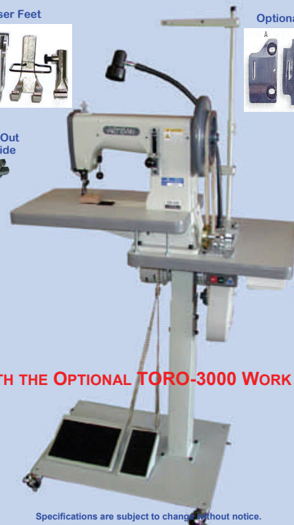
SHOWN WITH THE OPTIONAL TORO-3000 WORK PLATFORM

Specifications are subject to change without notice.