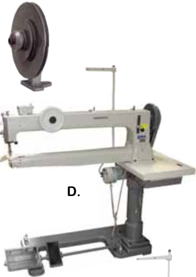
ARTISAN. SR-2 Ball Bearing Speed Reducer/ Speed Controller