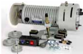
ARTISAN. Model ESM-400-2 D.C. Electronic Servo Motor

Heavy Duty 20 Ton "Clicker". Hydraulic die cutting machine. 220 volt single phase electricity. Swing-away cutting head 18" x 14" with a table platform of 18" x 35"